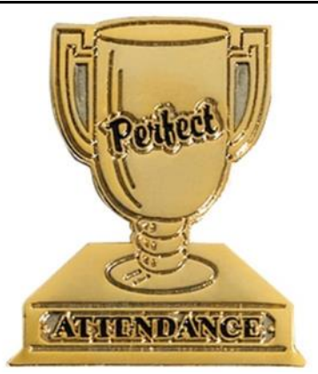
Congratulations 5Vale! 100% attendance this week