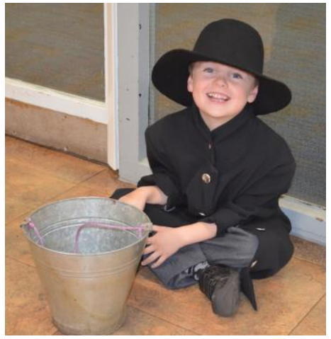
Y2C Class Assembly 'Great Fire of London'